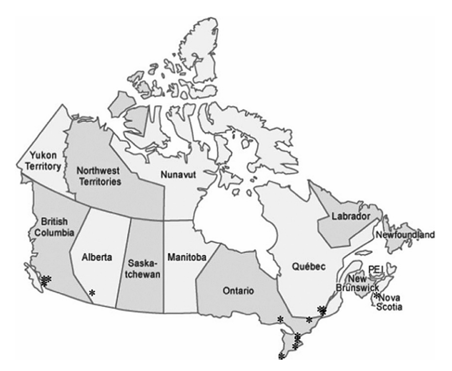
Fig. 1 Geographical distribution of centres participating in the Canadian Co-infection Cohort Study.

subsequent visit, laboratory assessments were performed, including complete blood count, serum chemistry, liver profile, plasma HIV RNA, absolute and relative CD4 lymphocyte counts and plasma HCV RNA. The duration of HCV infection was determined using the date of HCV seroconversion, if known, or the year of first injecting drug use (IDU) or blood product exposure as a proxy of HCV infection [11]. ART was defined as taking at least three antiretrovirals concurrently.