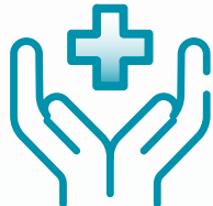
Trauma Informed Practice