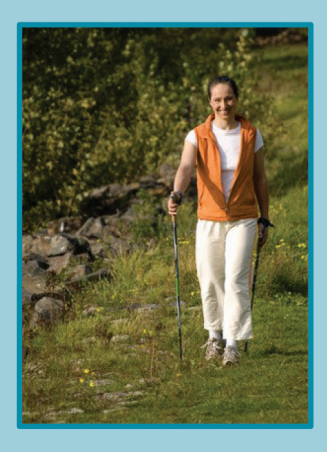
Most problems with urine or bowel leakage can be significantly improved or cured without the need for medications or surgery.