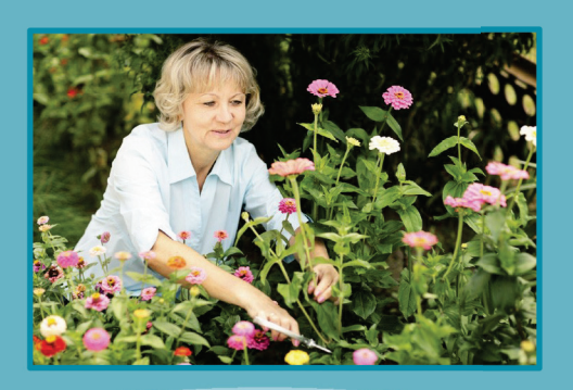
Incontinence, if left untreated, can worsen as you get older.